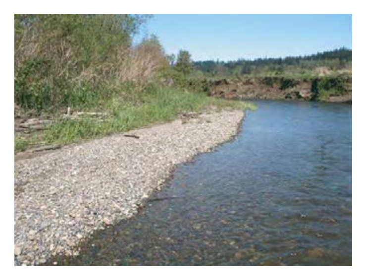
Existing gravel bar provides recreational opportunities

An example or "demonstration" project already implemented for the purpose of addressing this sort of vertical eroding streambank is