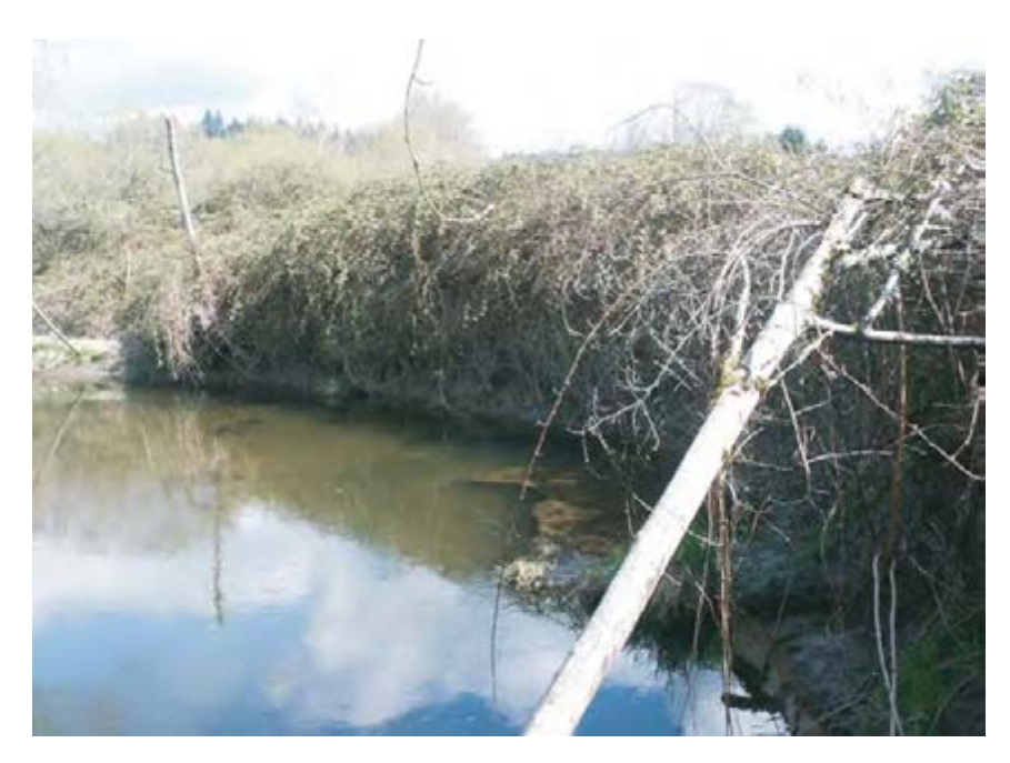
Invasive species on existing streambank