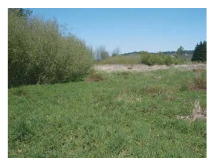
Fairly diverse existing vegetation

This fairly remote section of the park could be