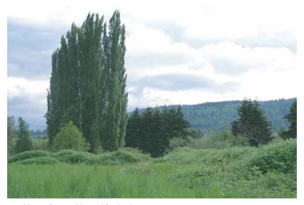
Possible site for an additional footbridge