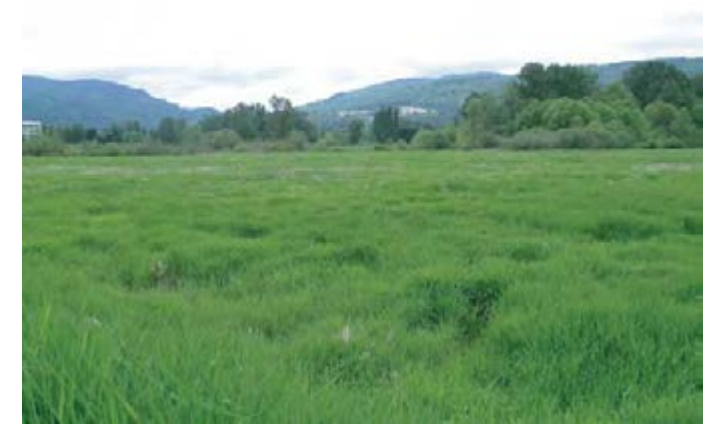
Reed canarygrass dominates the existing open field

There is tremendous opportunity to greatly improve wetland functions and wildlife habitat, as well as aesthetics at this site. The ditches could be plugged and/or meander flow pathways created to increase hydrologic diversity. Topography could be changed to create wetland depressions throughout the field to further increase the complexity and edge character of the habitat while altering microclimates to discourage invasive plants. Installation