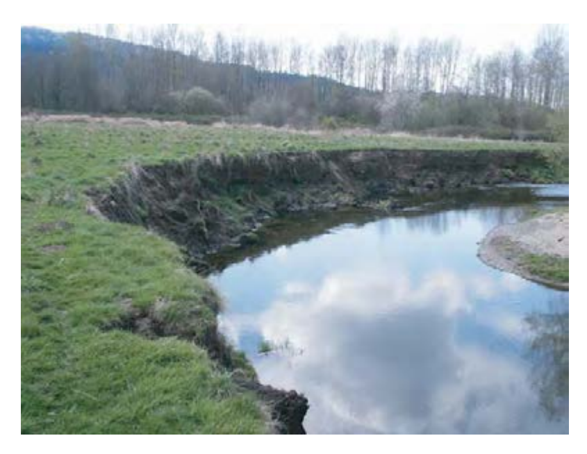
The migrating streambank