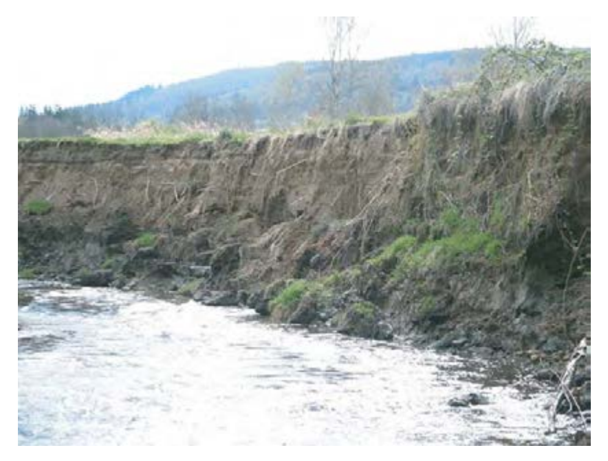
The eroding streambank