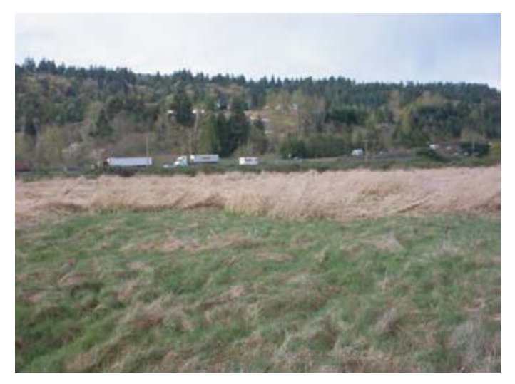
The abandoned hayfield along Interstate 90

This property provides a tremendous opportunity to greatly improve fish and wildlife habitat, as well as aesthetics. Schneider Creek could be relocated to the east with a meandering stream channel, associated backwater depressions, log structures, and revegetation with a diverse assemblage of native riparian and wetland plants. Other wetland depressions created throughout the field could further increase the complexity and