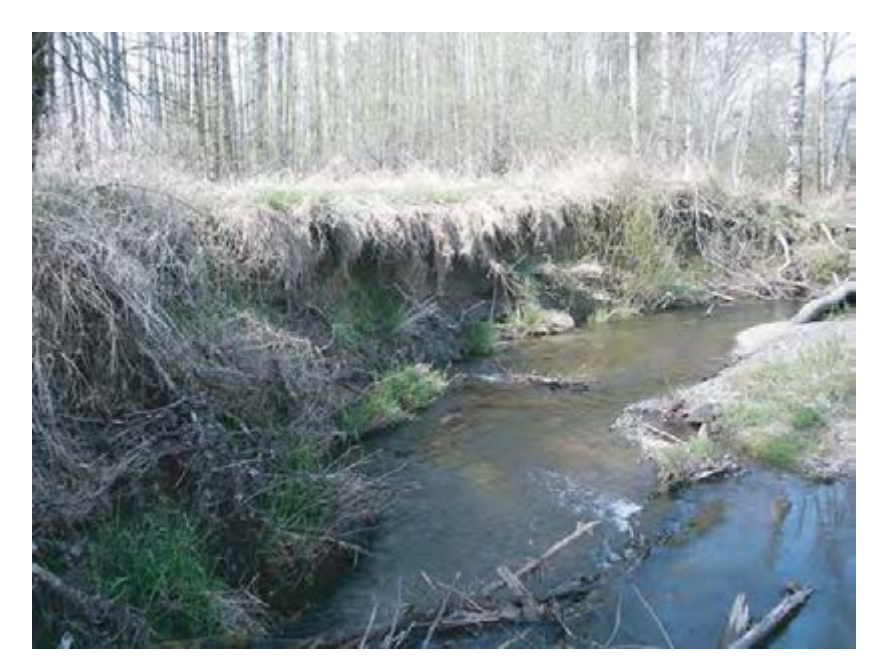
Streambank encroached by invasive species