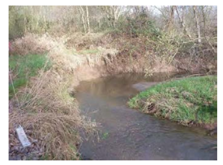
The existing Tibbetts Creek channel