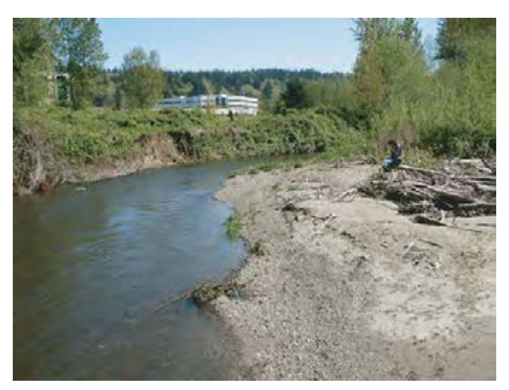
Existing streambank and gravel bar offer potential for recreational usage

An example or "demonstration" project already implemented for the purpose of addressing this sort of vertical eroding streambank is located just upstream of the park boundary on