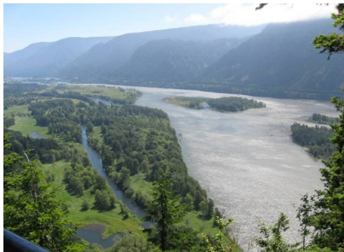
View from Beacon Rock Summit looking east.

The Beacon Rock Trail ascends to the top of Beacon Rock (850' elevation), one of the world's largest monoliths. The trail was built directly onto the side of the rock with 52 switchbacks. This amazing trail was originally built between 1915-1918 by philanthropist Henry Biddle. Views include the Columbia River Gorge, Bonneville Dam, and Pierce Wildlife Refuge. Interpretive panels along the trail explain history and geology.