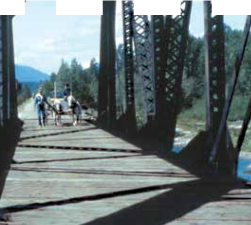
Palouse to Cascades State Park Trail